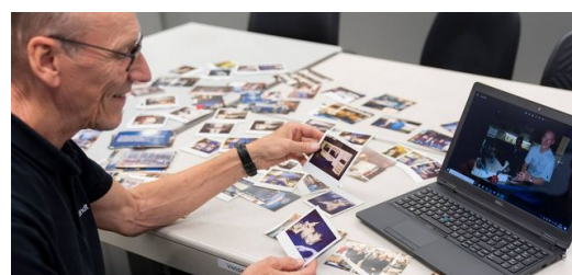
<p>Reminiscing about old times: He has captured thousands of photo