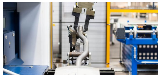
The systems in the machine network are operated automatically by a robot system that transports the parts automatically from one processing step to the next.