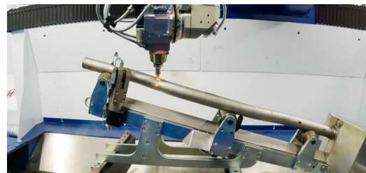
The TruLaser Cell 8030 3D laser system from TRUMPF enables the cutting of precise contours that cannot be introduced prior to bending, as they would otherwise risk deformation.