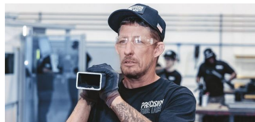
The right attitude: To work at PTL, you need commitment and the willingness to learn something new every day.