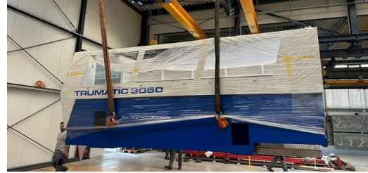
Heavy freight: The seven ton heavy bar arriving at the Matussek Metalltechnik assembly hall.