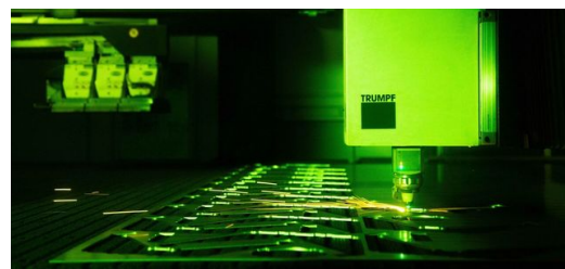
Hans Sanders considers process reliability to be of paramount importance, and he is particularly impressed by the safety features incorporated into the TruLaser Center 7030. As an example, the SmartGate integrated into the brush tables prevents parts from tipping over during the cutting process.