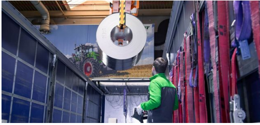
<p>One crane lift cycle now replaces five forklift truck trips - an immense gain in productivity.</p>