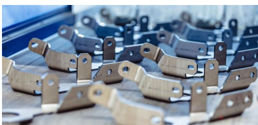
In their own sheet metal processing MERZ processes between 10 and 15 tons of thin sheet daily in a 3-shift operation. A large variety of parts with quantities of 1 to 1,000 as well as a high time pressure are challenges that come with daily work.