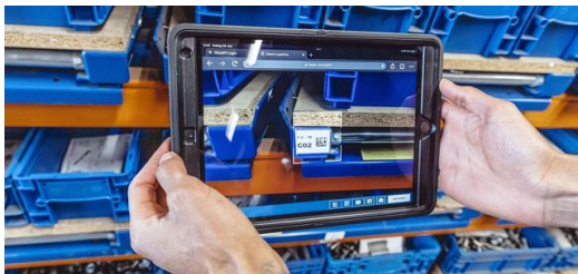
Employees at every workstation register every work step from beginning to end on a tablet in an App. The mobile access to all information makes daily work easier and brings transparency to the procedures.