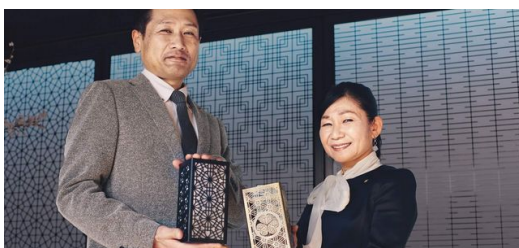
Top-sellers: Each lantern is unique, featuring its very own complex geometric pattern.

Producing aluminum is an energy-intensive process, however. This wasn’t a good fit with Ueki’s sustainability goals, so the decision was made to use regionally produced Japanese iron instead. The production process requires significantly less energy, and the resulting iron can easily be maintained in good condition and stored for an almost indefinite period. The journey from the initial business idea to the first respectable prototype of a Kumiko component took more than a year. But the superior quality of the results was well worth the wait. “The inspiration of traditional Kanuma Kumiko techniques is clearly visible. And our ability to successfully produce so many different geometries ultimately comes down to the outstanding precision of the TRUMPF laser system. The machine has brought us very close to meeting our goal of absolute symmetry,” says Nakamura.