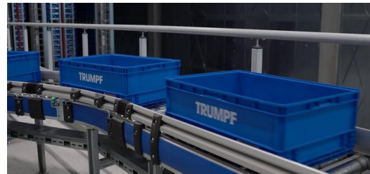
The first few meters on route to the customer: plastic bins contain up to four insert boxes for small parts.