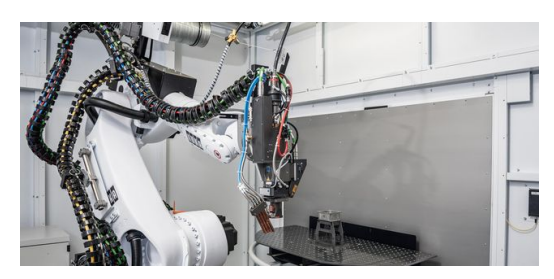
The laser network, serving a TruLaser 3030 ber and a TruLaser Robot 5020, expands the range of services offered by SCS by adding laser cutting and welding.