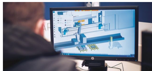
Giacomo Bianchi primarily envisaged using the TruBend Cell 5000 to bend larger housings and mounting devices.