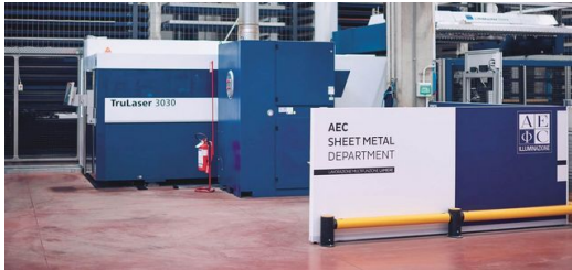
The TruLaser 3030 fiber 2D laser-cutting machine laid the foundations of AEC Illuminazione's close partnership with TRUMPF. Its connection to an automated storage system made production much faster.

achieve this, Bianchi has now connected up 85 percent of the company's machines. The MES generates production schedules and ensures smooth operation of the manufacturing environment. The design engineers can send their CAD drawings straight to the machines, where the data is imported and turned into finished parts as and when they are needed. The MES also collects machine data and key metrics for quality monitoring, machine utilization and production status. "By connecting everything together, we've created a truly transparent production environment. Tailoring our production schedules to the needs of our employees and machines helps to shorten throughput times and improve on-time delivery over the long-term," says Bianchi.