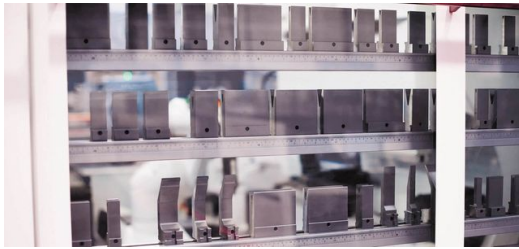
To manage production peaks, Giacomo Bianchi invested in tools that allow parts to be produced on both the TruBend Cell 7000 and the TruBend Cell 5000.