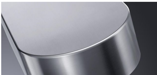
Besonders wenn höchste Ansprüche an die Qualität der Nähte gestellt werden, punktet das Laserschweißen.