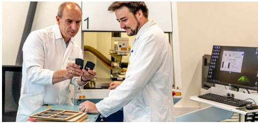
Standardized processes are the key to success for MED-EL. A high contrast is crucial for this because it ensures good readability. TruMark lasers cope with this job with aplomb.