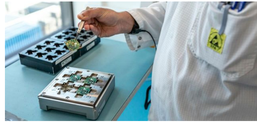
To make the devices more comfortable to wear, the components are becoming ever smaller. Nevertheless, the markings and codes must be resistant and machine-readable.