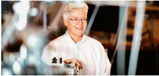
<p>Professor Anne L’Huillier helped found the field of attosecond laser physics. This work may soon shine a light on the world of electrons.</p>

L’Huillier: It’s hard to give a well-defined vision. But that’s how it is with basic research.