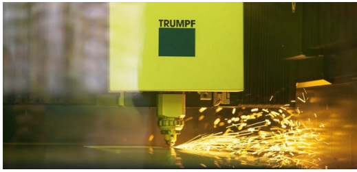
In March, FBT workers started using their new TruLaser 3030 to cut thin sheets and blanks to size.