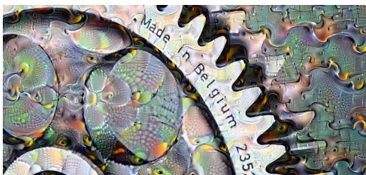
The dream in the workpiece?