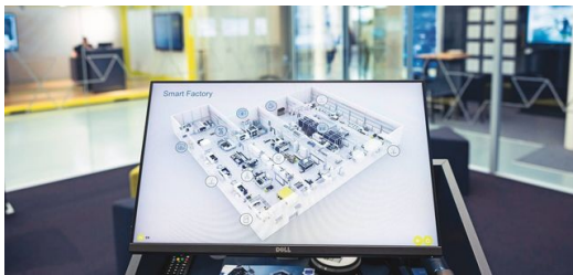
Machine data collected by TRUMPF in its smart factory helps the computer vision team to train the AI.

In this business model, TRUMPF’s fully automated flagship is located at the customer’s site, where it produces the desired parts; but control of the machine lies in the hands of a TRUMPF team at the Neukirch site in Saxony, which operates in three shifts, including at night. The cameras keep the team updated on every aspect of the machine’s operation and deliver a non-stop stream of data. If a sheet-metal part gets stuck, the cameras record a short clip starting a few seconds before the event and ending a few seconds after. This helps the AI learn how to avoid such errors in the future. AI offers numerous potential benefits and uses, some of which are still in their infancy. Examples include more-efficient machine utilization, longer running times, higher part quantities, savings on materials, predictive maintenance and assistance systems. “There’s a lot happening in computer vision at the moment,” says Weiß. He is excited about 2024, which will introduce features such as smart cameras – some even with AI functions – to TRUMPF machines.