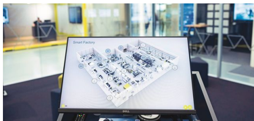
<p>Machine data collected by TRUMPF in its smart factory helps the computer vision team to train the AI.</p>

In this business model, TRUMPF's fully automated flagship is located at the customer's site, where it produces the desired parts; but control of the machine lies in the hands of a TRUMPF team at the Neukirch site in Saxony, which operates in three shifts, including at night. The cameras keep the team updated on every aspect of the machine's operation and deliver a non-stop stream of data. If a sheet-metal part gets stuck, the cameras record a short clip starting a few seconds before the event and ending a few seconds after. This helps the AI learn how to avoid such errors in the future. AI offers numerous potential benefits and uses, some of which are still in their infancy. Examples include more-efficient machine utilization, longer running times, higher part quantities, savings on materials, predictive maintenance and assistance systems. "There's a lot happening in computer vision at the moment," says Weiß. He is excited about 2024, which will introduce features such as smart cameras – some even with AI functions – to TRUMPF machines.