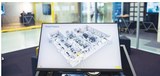
Machine data collected by TRUMPF in its smart factory helps the computer vision team to train the AI.

In this business model, TRUMPF’s fully automated flagship is located at the customer’s site, where it produces the desired parts; but control of the machine lies in the hands of a TRUMPF team at the Neukirch site in Saxony, which operates in three shifts, including at night. The cameras keep the team updated on every aspect of the machine’s operation and deliver a non-stop stream of data. If a sheet-metal part gets stuck, the cameras record a short clip starting a few seconds before the event and ending a few seconds after. This helps the AI learn how to avoid such errors in the future. AI offers numerous potential benefits and uses, some of which are still in their infancy. Examples include more-efficient machine utilization, longer running times, higher part quantities, savings on materials, predictive maintenance and assistance systems. “There’s a lot happening in computer vision at the moment,” says Weiß. He is excited about 2024, which will introduce features such as smart cameras – some even with AI functions – to TRUMPF machines.