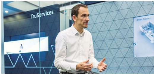
Explaining AI: The TRUMPF computer vision expert is happy to explain how AI can improve sheet-metal cutting.