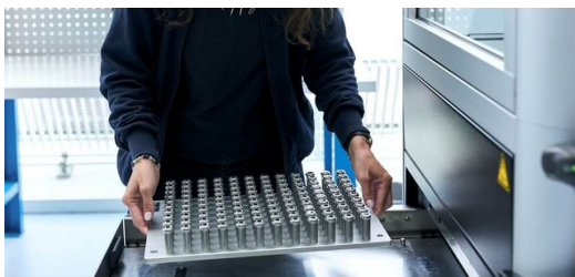
The automation cell is equipped with four drawers. There is space for 960 components. They are loaded and unloaded while the machine is welding.