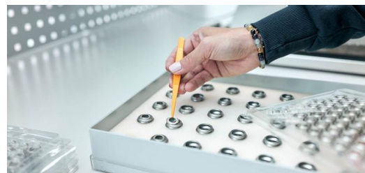
Preparation for the welding process: Placing the lenses on the stainless-steel sleeves is still manual work.