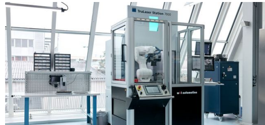
Efficient duo: At the Widnau site in Switzerland, endoscope manufacturer Karl Storz welds eyepieces on a TruLaser Station 7000. A mobile robotic cell takes care of loading and unloading the components.