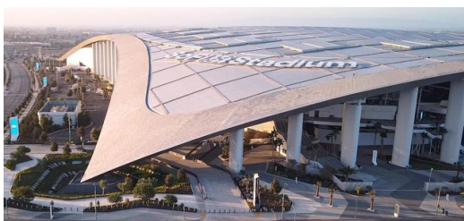
The roof of the SoFi Stadium is light and elegant. The cover made of the translucent plastic ETFE can be opened and closed.

Built at a cost of some 5 billion euros, the SoFi Stadium sports and entertainment complex near Los Angeles, with its event venues, parks and restaurants, is said to be the most expensive stadium in the world. The execution of the project was an extraordinary challenge for TRUMPF and its US customer, architectural engineering company A. Zahner. To build the SoFi, the Kansas City, Missouri-based metalwork experts used three TRUMPF machines to cut and punch 37,000 unique panels featuring some 30 million holes distributed at irregular intervals. This was made possible thanks to a customized software solution developed in Ditzingen.