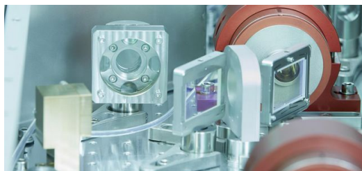
<div class="indent">Optics for laser amplifier in science. </div>

Ultimately there's one key thing that any potential entrepreneur needs to remember: if you're looking for an idea that amounts to more than just lines of code, you would be wise to take a careful look at what lasers can do. Or think carefully about what people who work with lasers need. Or at least mull over what lasers can do to help people who are planning something new – or who are simply looking to save the world.