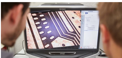
Part of the visual inspection involves documenting homogeneous ablation. The ablation zone is dark and shows the plastic surface. The key to successful machining is to ablate the gaps cleanly to provide electrical insulation between the conductive tracks.