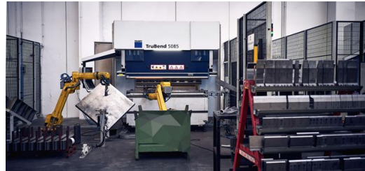
Robot colleague: For the employees at Omas S.p.a., robots have long been part of everyday life.