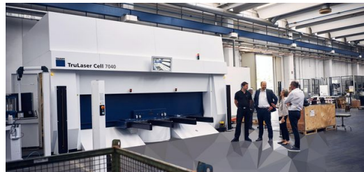
The TruLaser Cell 7040 in the production hall of Omas S.p.a.