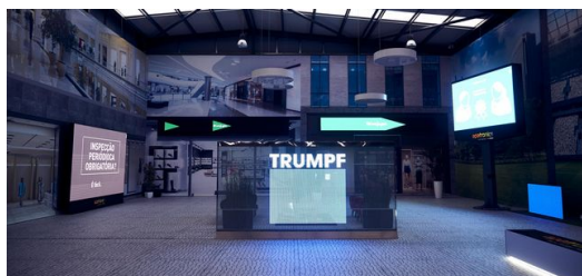
Authentic: Cobblestones in the showroom help provide an authentic atmosphere.