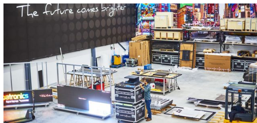
Tailor-made: Apametal develops and builds each digital sign itself.