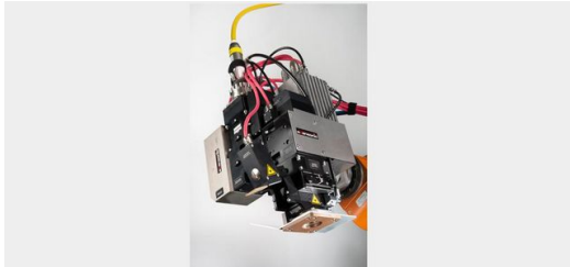
The laser processing optics system designed using modules supplied by specialist manufacturer Sansonic is equipped with a highly dynamic 1D scanner unit capable of generating variable track widths, and is compatible with industrial-scale production.

The complex geometry of the cam pieces coupled with their low wall thickness precluded the use of conventional hardening processes. To find a more suitable solution, the process engineers in Stuttgart-Untertürkheim joined forces with specialists at the production plant in Berlin and the Steinbeis Technology Transfer Center in Pforzheim to develop a new low-distortion laser hardening process to precisely fit the needs of this application. Compared with conventional hardening methods, the heat load acting on the component is reduced by up to 90 percent.