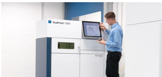
TruPrint 1000: TRUMPF's TruPrint 1000 3D printer