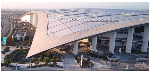
The roof of the SoFi Stadium is light and elegant. The cover made of the translucent plastic ETFE can be opened and closed.

Built at a cost of some 5 billion euros, the SoFi Stadium sports and entertainment complex near Los Angeles, with its event venues, parks and restaurants, is said to be the most expensive stadium in the world. The execution of the project was an extraordinary challenge for TRUMPF and its US customer, architectural engineering company A. Zahner. To build the SoFi, the Kansas City, Missouri-based metalwork experts used three TRUMPF machines to cut and punch 37,000 unique panels featuring some 30 million holes distributed at irregular intervals. This was made possible thanks to a customized software solution developed in Ditzingen.