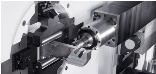
<p>The latest version of the TruLaser Tube 7000 comes with an thread tapping system. The built-in package caters to both standard thread tapping and flow tapping.</p>