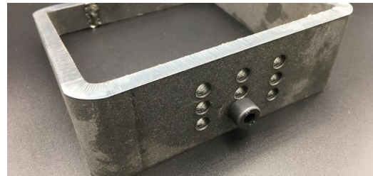
<p>The TruLaser Tube 7000 can be used to fabricate a range of different threads in tubes.</p>

Since the summer of 2017, the company's plant in the Swabian Jura region has been using a test unit of the TruLaser Tube 7000 laser tube cutting machine with integrated tapping system. "We are delighted to be working with TRUMPF on this kind of collaborative project, and we are certainly impressed with the new technology," says Frank Steinhart. The CO2 laser cuts tubes and profiles without leaving burrs and offers bevel cuts of up to 45 degrees, diameters up to 254 millimeters and wall thicknesses of between one and ten millimeters.