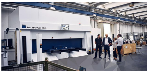
The TruLaser Cell 7040 in the production hall of Omas S.p.a.