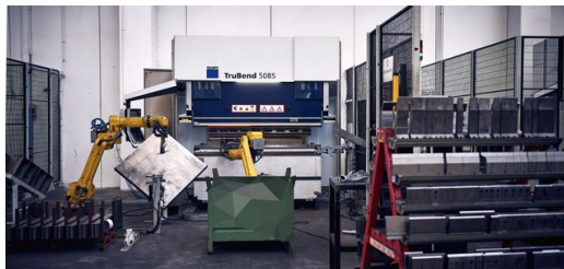
Robot colleague: For the employees at Omas S.p.a., robots have long been part of everyday life.