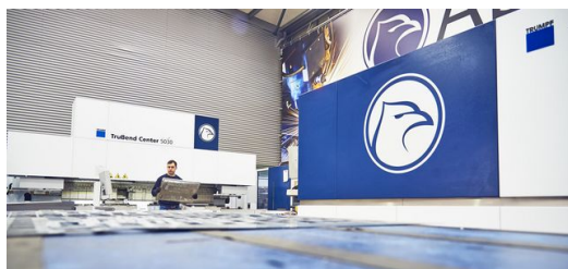
<p>Most up-to-date technologies: Worker with the TruBend Center 5030</p>