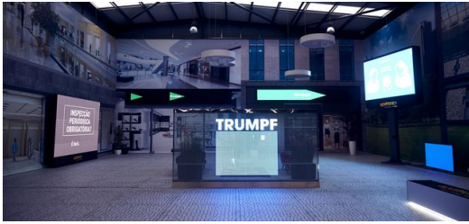
<p>Authentic: Cobblestones in the showroom help provide an authentic atmosphere.</p> – Frederik Dulay-Winkler