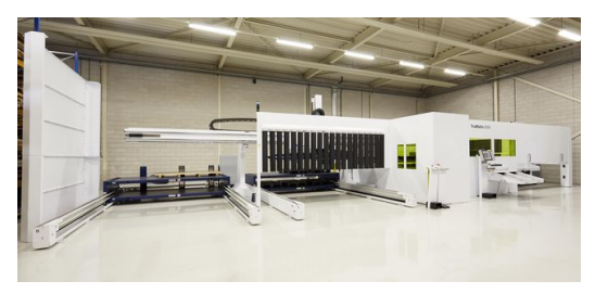
"Automating our machines eases the work for the employees. Instead of tedious and troublesome loading and unloading operations, they can devote their attention to other tasks during production operations," Sander Mutsaers explains.

"Even after this short period in use we have been able to reduce by 40 percent the time needed to manufacture the front panel of a pay-and-display machine, made of aluminum and stainless steel. The separate working phase at the press brake for small bendings is eliminated because the new punch laser cutting machine already takes care of the necessary bends," he tells us. Formed areas – like brackets, threads and hinges – are now made up quickly and easily on the TruMatic 6000 fiber. Four TRUMPF press brakes are used when processing larger parts and assemblies.