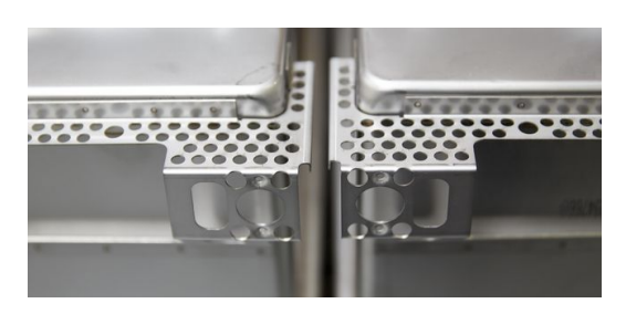
Formed areas – like brackets, threads and hinges – are now made up quickly and easily on the TruMatic 6000 fiber.