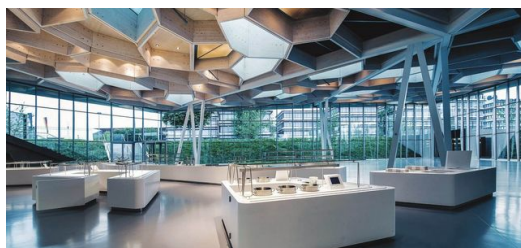
Meeting place: The Blautopf is more than just a staff restaurant.