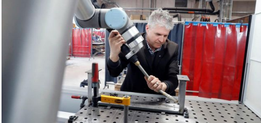
<p><span lang="EN-US">The TruArc Weld 1000 is the entry into simple welding for the company zweifel metall ag.</span></p>