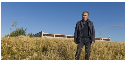
The company ELFIM s.r.l. is situated on a bleak and desolate limestone plateau near Gravina in Puglia.