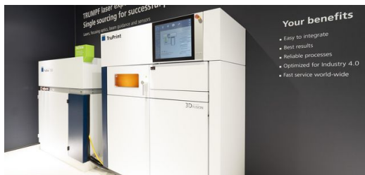
TRUMPF prints copper and gold with a new green laser

For another first at Formnext, TRUMPF printed pure copper and gold using a green laser. The company's developers achieved this by linking the new TruDisk 1020 disk laser and TruPrint 1000 3D printer. The former's wavelength is in the green spectral region, and unlike infrared lasers, it is able to weld highly reflective materials such as pure copper and gold. None of the expensive material goes to waste, which the jewelry industry is sure to appreciate. And the electronics and automotive industries benefit from components made of pure copper, an excellent conductor of electricity and heat.