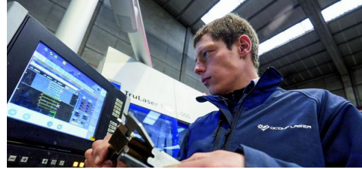
The simple operating concept behind the TruTops Tube software makes possible exact calculation of cutting geometries. Even complex calculations at the corners of rectangular profiles are automatically handled by this program.