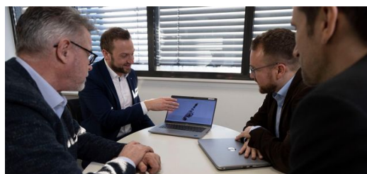
The MultiFocus optics developed by TRUMPF especially for BENTELER produce outstanding results in the pore-free, gas-tight welding of aluminum in combination with BrightLine Weld.