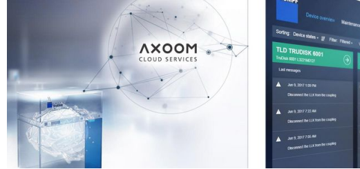
Some of the data is uploaded to the AXOOM Cloud via the Internet.