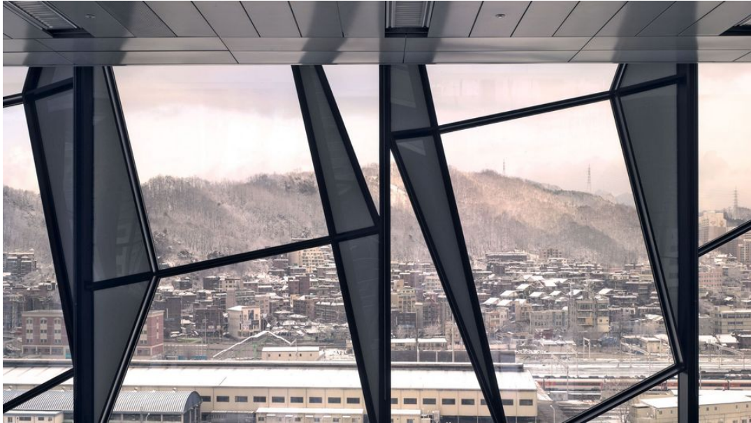
TRUTEK Building in Seoul, Korea.