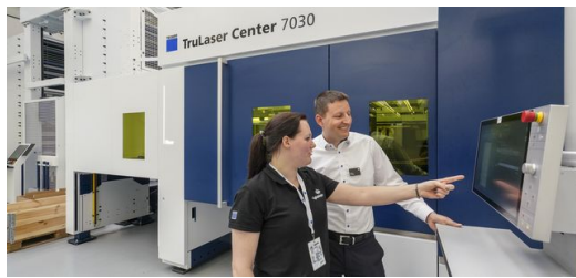
Agile methods have long been used in software development, but now they are making inroads into other areas such as mechatronics. The fully automated TruLaser Center 7030 was developed using agile methods.

“There are certain tasks where agile might not be the best approach, however. That’s why we’re not aiming to abandon methods that have worked well for TRUMPF in the past, but rather to combine both approaches,” says Schlegel.