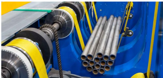
TruLaser Tube 7000, transfluid

TruLaser Tube 7000 fiber transfluid TruLaser Cell 8030. 3D ,