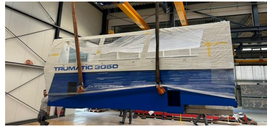
Heavy freight – the seven-tonne bar arrives at the assembly hall of Matyssek Metalltechnik.